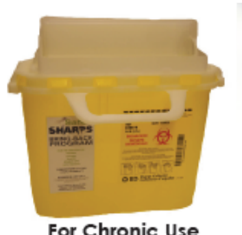
For Chronic Use