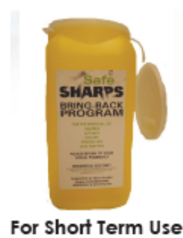
For Short Term Use

Must be yellow, sealed, leak-proof, puncture resistant and contain PANS program sticker